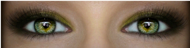
LC Natural Health & Beauty Real'eyes' Your Natural Beauty Eye Shadow Colours