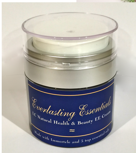
This new product pairs beautifully with LC Natural's Ant'eye' Wrinkle Treatment and "Look of Youth" Neck Treatment.

Introducing Everlasting Essentials EE Cream for the face and décolleté. This luxurious face cream is a powerhouse of ingredients that nourishes and revitalizes the skin with properties that are AA-Anti Aging, BB-Beauty Balm, CC-Colour Correcting, DD-Daily Defence and are formulated with the top 3 flower essences that are everlasting and essential to any skin care regime.