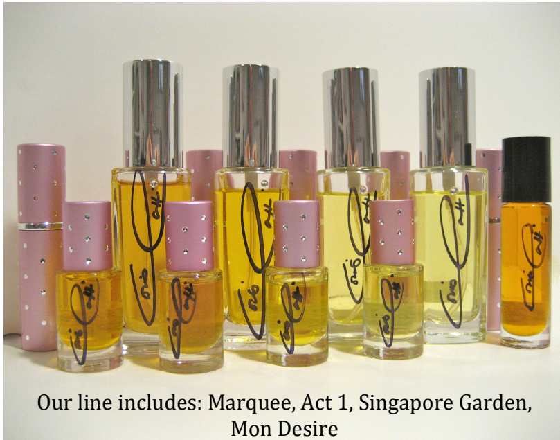
Our line includes: Marquee, Act 1, Singapore Garden, Mon Desire

Rose, Chamomile, Lavender, Helichrysum, Sandalwood, Black Pepper, Cypress, Frankincense, are just some of nature's treats when it comes to fragrance in the natural world.